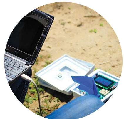
Pictured is the computer connected to the soil sensors to collect and store moisture readings directly from the field. The information will be used to make an informed irrigation decision.